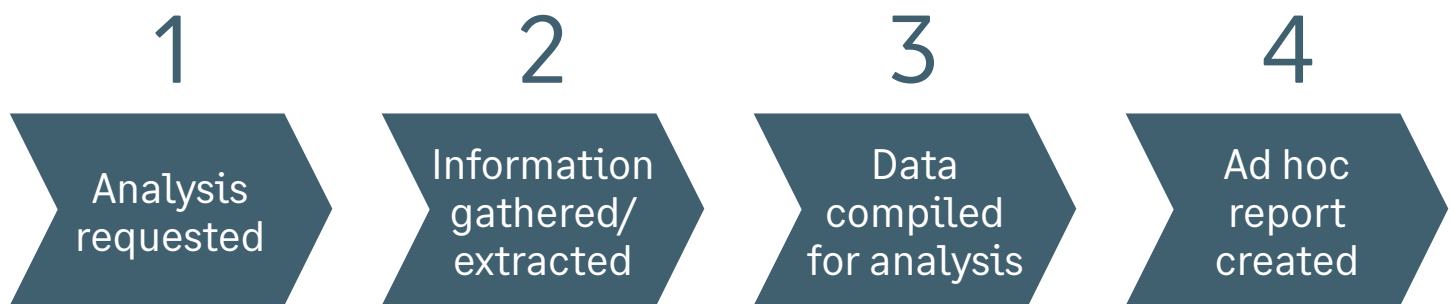
Figure 2: Process for developing an ad hoc report

Real-time reporting has evolved to fill in the gaps created by these time lags and supplement the content of standard financial reports with operational data. Ad hoc reporting often follows a process as depicted and described in Figure 2.