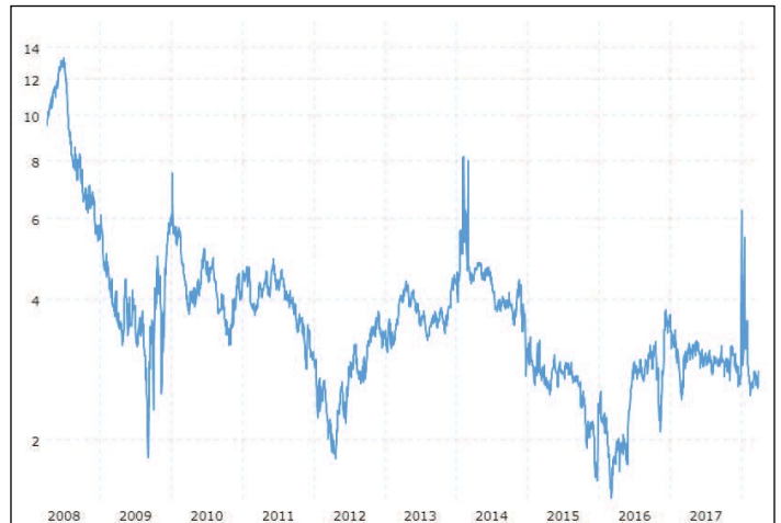
Figure 1: U.S. natural gas prices

We can layer on an incremental challenge in many industries where the business environment changes more often and more dramatically than ever before as well. Take for instance commodity prices, which have seen increasing levels of volatility in recent years. Imagine you are a company impacted by the price of natural gas (Figure 1) and consider the implications these price swings can have on your business model. That is but one example of a changing strategic driver. Consumer tastes and demands can shift virtually overnight. Every day, new technologies and new business models replace old technologies and old business models. The luxury of time is something few executives have any more when it comes to making decisions.